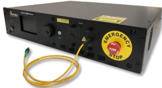
2U Rackmount Casing